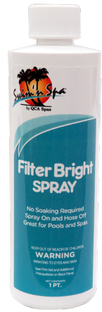
Bottle shown without included spray nozzle.

The cartridge filter does a big job by removing many of the body oils and minerals found in your spa water. With regular cleaning you can extend the life of the filter.